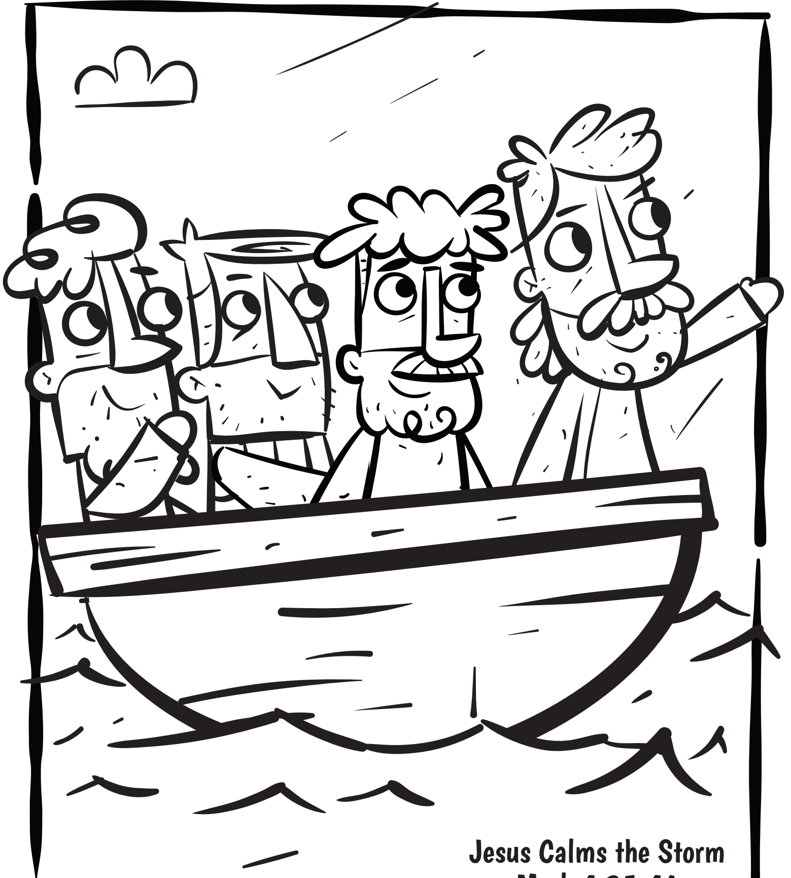
Jesus Calms the Storm Mark 4:35-41